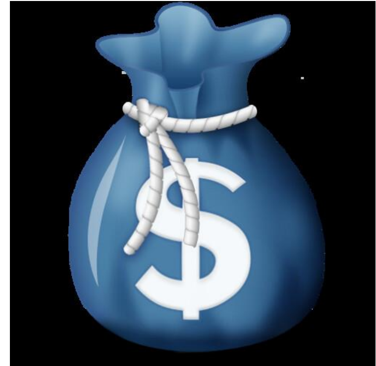
"Money Bag in Blue" by dolphinsdock is licensed under CC BY-NC-ND 2.0